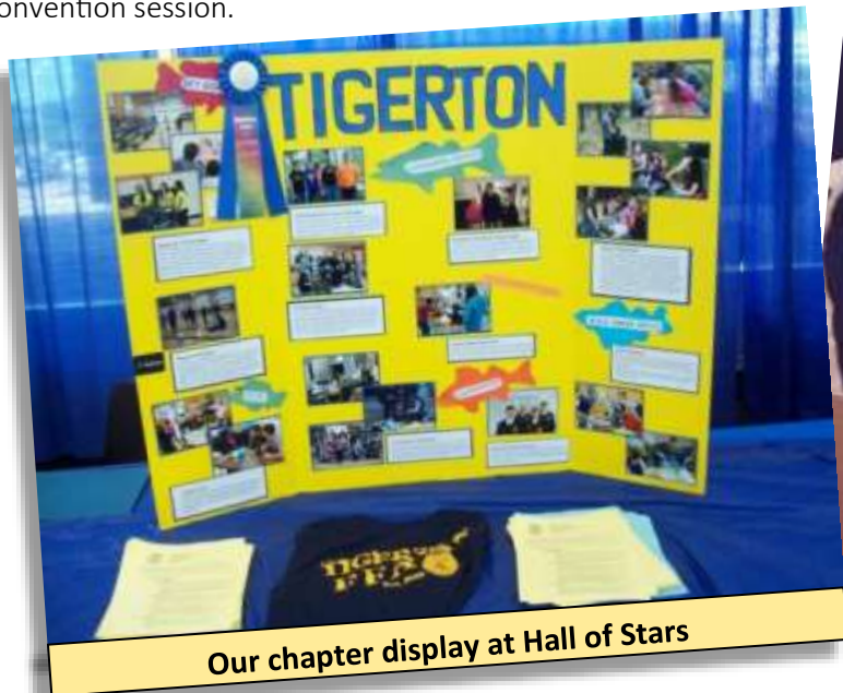
Our chapter display at Hall of Stars